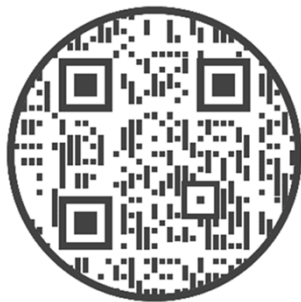
Registration QR Code