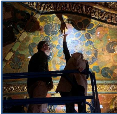
Gilded and stenciled finishes conservation, El Capitan Theatre, Los Angeles, CA, Morgan, Walls & Clements, 1926

The Technical Committee for Materials was created in 2016 to serve as a clearinghouse for information on both materials and architectural assemblies of historic building construction, and materials for building repair.