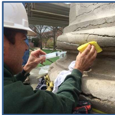
Stone treatments using lime injection at The Columns (Missouri University, Columbia, MO), Stephen Hills, 1840

The committee sponsored a multi-day workshop at the APT 2019 Miami Conference. The workshop included technical instruction along with on-site assessment of limestone and terrazzo to demonstrate approaches to testing for preservation projects.