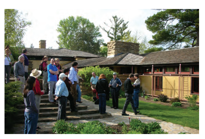
Fig. 10. Nondestructive Evaluation Methods Workshop at Taliesin, 2011.