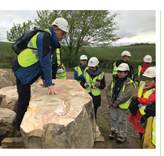
Fig. 11. Visit to Drumhead Quarry during the stone conservation workshop cosponsored by Historic Environment Scotland, 2018.