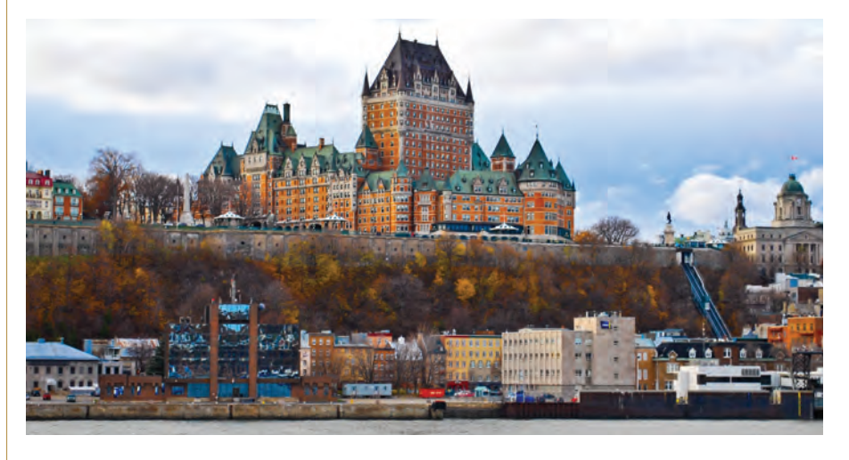
Fig. 8. Château Frontenac, Québec City, headquarters for the 2014 annual conference.

Another effort of the Publications Committee was the creation of the