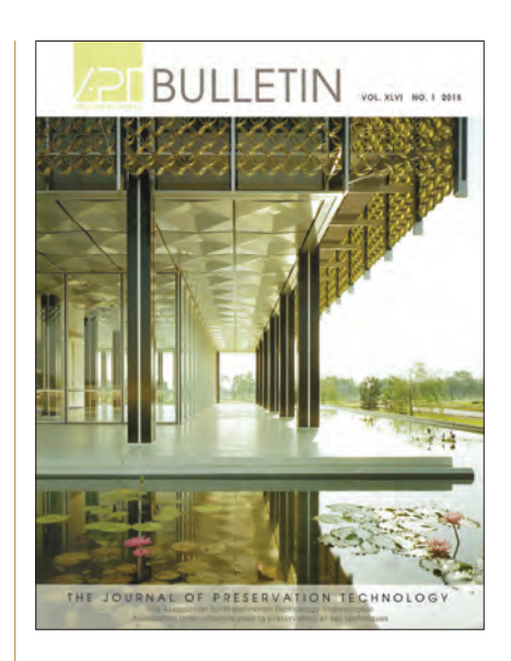
Fig. 4. Spring 2015 APT Bulletin , the first full-color issue.

The 2009–2014 strategic plan also called for establishing an archive.