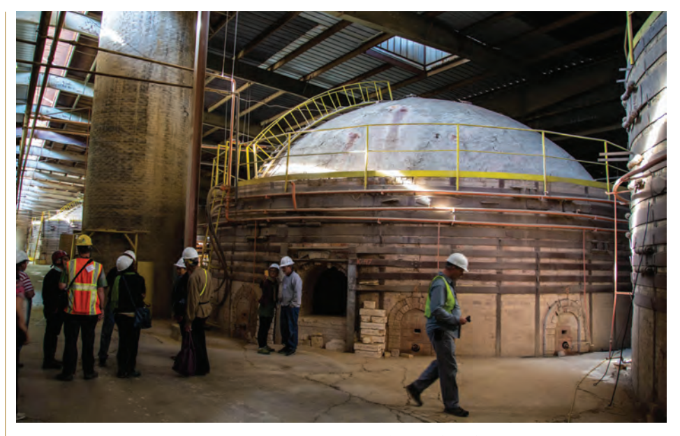
Fig. 13. Tour of the Gladding, McBean factory hosted by the Western Chapter, 2015.

The symposium planned for the 50th anniversary conference in Buffalo Niagara is entitled "The Next Fifty." While the impact of APT within the field of heritage conservation has been profound, the context and the stakes are changing. APT members form a kinship of shared convictions—that the preservation of the built environment, with its objects and surroundings, represents, in large part, the preservation of human culture but that proper approaches and technology must be brought to bear to accomplish the mission. Many of the tools, devices, and materials available now were scarcely imaginable at APT's birth in 1968. In the interim, transformative technologies have emerged and been superseded. Remember cassette recorders, Palm Pilots, and fax machines? The iPhone