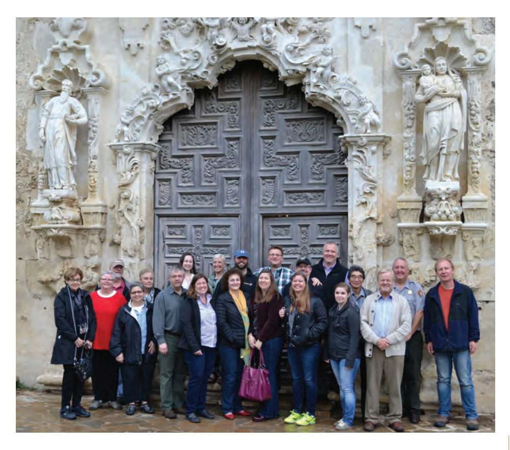
Fig. 1. APT Board of Directors and friends at Mission San José during the San Antonio board meeting, 2015.

As the Association for Preservation Technology entered its fifth decade in 2008, the field of heritage conservation was a well-established discipline. At APT's founding in 1968, very few architects or engineers in private practice were able to devote their efforts to the preservation of historic buildings. Columbia University's pioneering program in historic preservation was just four years old, and the field of architectural conservation had yet to be born. By 2008 APT's membership included preservation architects (called "conservation architects" in Canada) and engineers in private practice and government, contractors and tradespeople, professors in historic-preservation programs, materials scientists, architectural conservators, students, and other historic-preservation professionals in government and private employ. This multidisciplinary constituency created a fertile ground for the development and propagation of technical solutions to the often knotty problems of preserving and conserving the physical manifestations of culture.