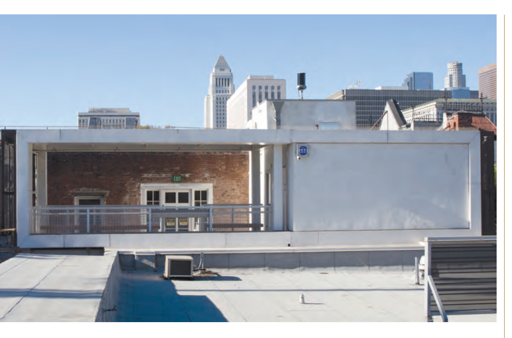
Fig. 7. Viewing platform, which provides visitors access to a nearby rooftop with an unobstructed view of the mural.