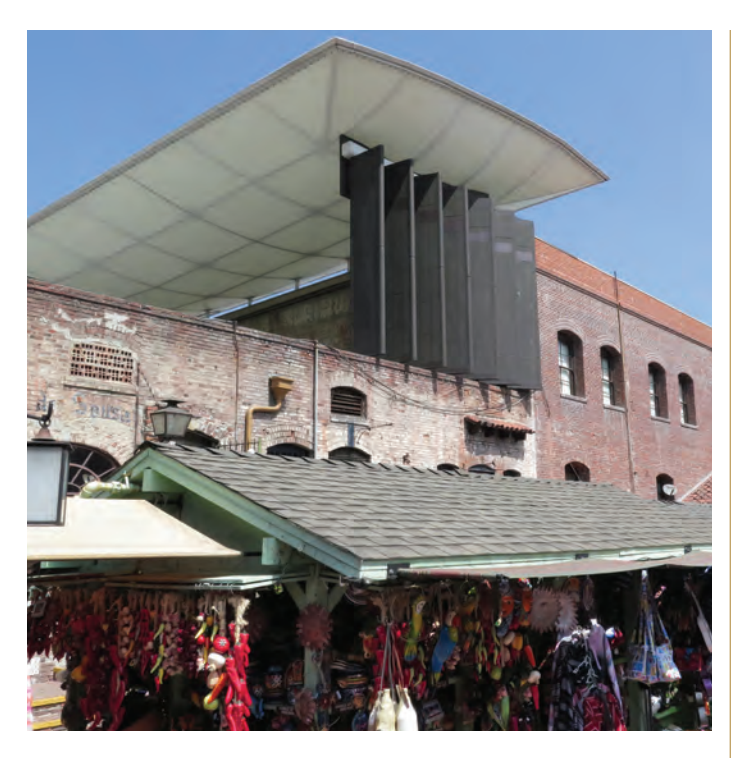
Fig. 6. View of the canopy shelter from Olvera Street, showing the vertical metal louvers, which provide protection from sunlight directly hitting the mural at the two sides and allow for a partial view of the mural and shelter from the street.

Because the shelter is located within a historic district, it had to be structurally independent of the unreinforced masonry buildings over which it was constructed. This requirement was achieved by supporting the canopy of the 80-foot-wide shelter on two steel