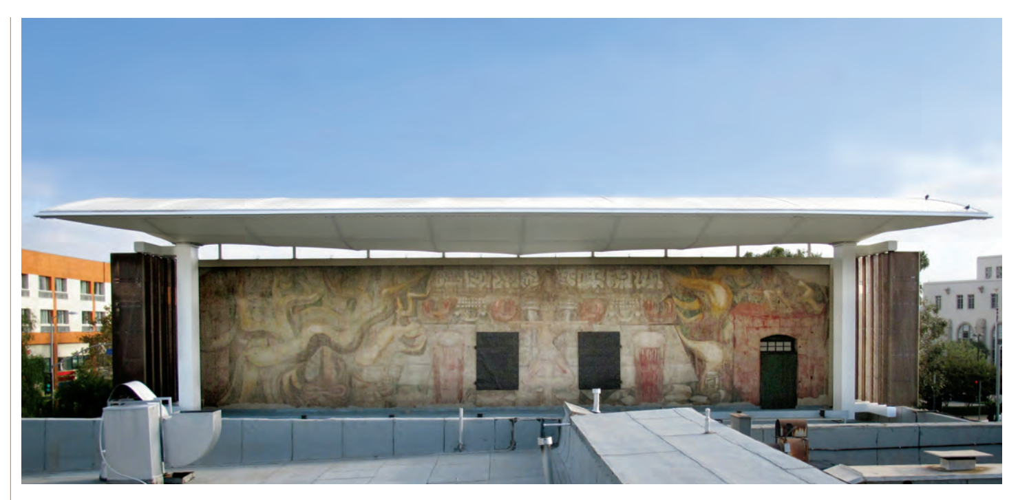
Fig. 4. View of América Tropical and the canopy shelter from a nearby rooftop. Mural © 2012, Artists Rights Society (ARS), New York/Sociedad Mexicana de Autores de las Artes Plásticas (SOMAAP), Mexico City.