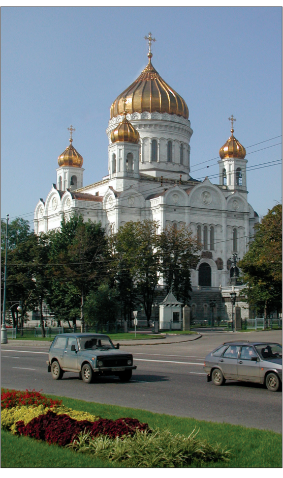
Fig. 2. Cathedral of Christ the Saviour, Moscow, Russia, built 1839–1880, reconstructed 1995– 2000, photograph 2004.

tion, then we lose the physical presence of our past. Professionals in the field of preservation have, as part of our field of work, a say in deciding what is and what is not saved. Our decisions are based on the condition of the buildings we see, on their cultural value, and on the economic and technical resources available for their restoration. The second and third factors are obviously influenced by our beliefs about what is important: we react differently to the fire damage at Notre-Dame in Paris or the Mackintosh Building at The Glasgow School of Art than we do to similar damage at less famous and less beautiful buildings. The difference between carefully restored row houses that are designated as landmarks and those that are demolished may be nothing more than the economic status of the city or neighborhood in which they are located.