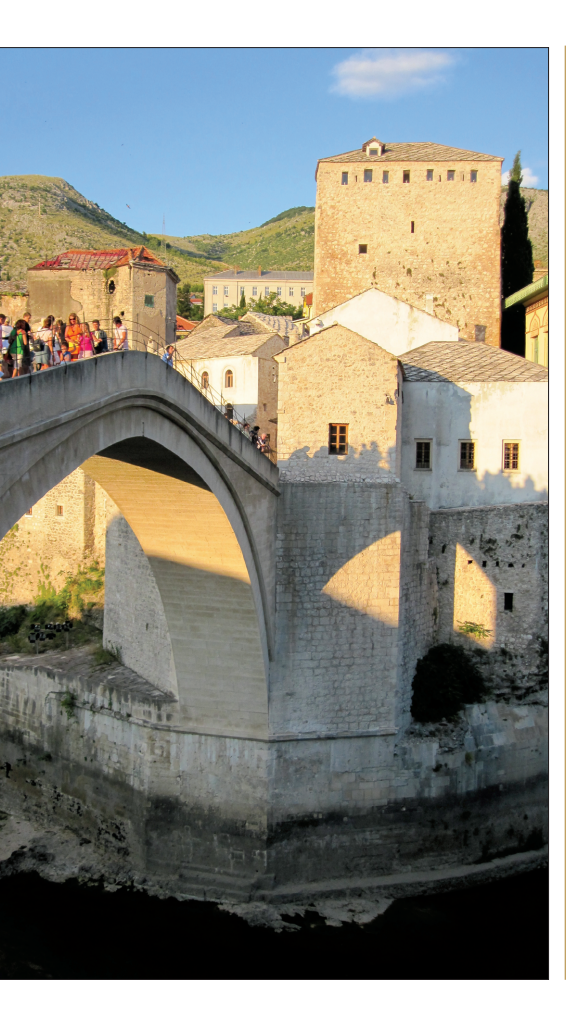
Whose Authenticity Is It, Anyway?