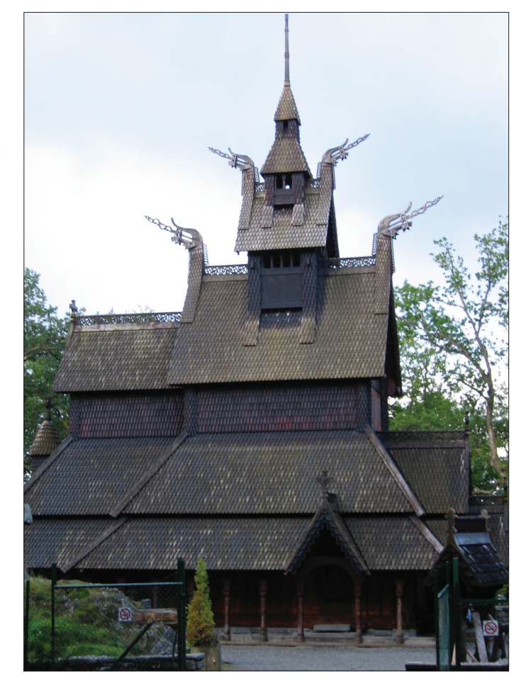
Fig. 4. Fantoff Stave Church, Bergen, Norway, built 1150, before moving to Bergen in 1882, reconstructed 1995, photograph 2004.

As heritage experts, we tend to back away from reconstructions because of their impact on authenticity. But when traumatic events occur, reconstruction can be a tool for recovering cultural identity, or it can be used as an expression of defiance and bravery, particularly when the destruction of cultural heritage is deliberate. Take, for example, the Fantoft Stave Church in Bergen, Norway, a reconstruction completed in 1995 (Fig. 4). The original church dated to 1150 and was moved to Bergen from Fortun in 1882. It was burned to the ground by Satanists in 1992. However, there was meticulous documentation, and the community decided to rebuild the church as it was of great significance to them.<sup>7</sup>