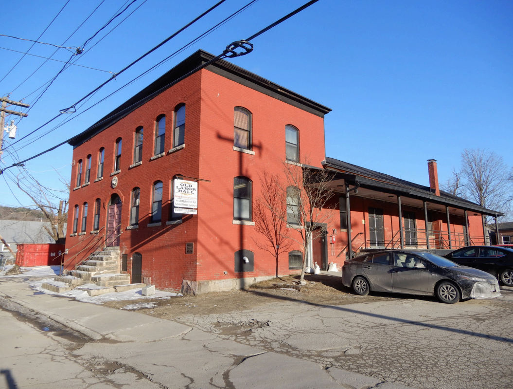
Overview of the Old Labor Hall in Barre, Vermont.