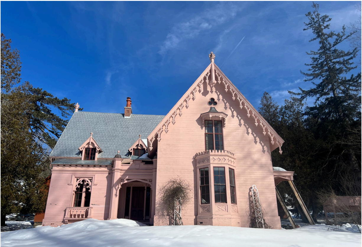
Front elevation of the Justin Morrill Homestead in Strafford, Vermont.

Below and on the following pages are photos from their trip.