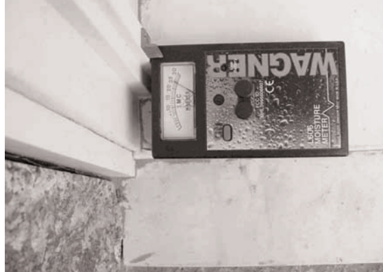
Fig. 9. Capacitance-type moisture meter being used on window sill.