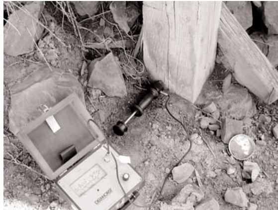
Fig. 10. Conductance-type moisture meter being used on a timber column in contact with the ground.