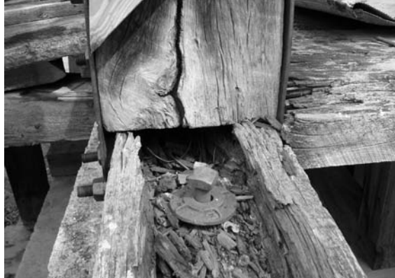
Fig. 6. Decayed beam supporting a timber column.