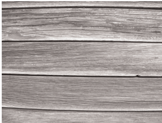
Fig. 5. Weathered cladding, considered aesthetically pleasing.

stiffness but also to determine whether there will be significant differential shrinkage if other woods are used for repairs.