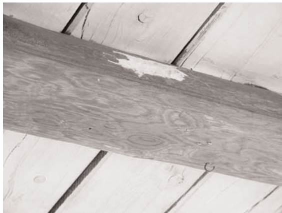
Fig. 7. Insect damage on a porch beam, as evidenced by the yellow frass from powder post beetles.