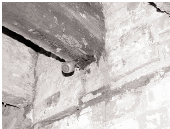
Fig. 8. Awl inserted to probe the interface between a timber beam and a masonry wall.

the knowledge of how grades are established within the design codes.