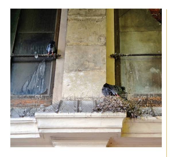
Fig. 2. Passage Vendome, Paris 3e, France, showing soiling of buildings caused by nesting pigeons. Note the inefficacy of the spikes.

This paper summarizes the factors that influence the components of bird excreta (especially that of pigeons), since they have a bearing on the impact that excreta may have on architectural metals. The final part of the paper reviews and evaluates the few extant experimental studies that have been carried out on this topic.