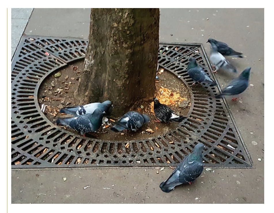
Fig. 4. Porte des Vanves, Paris 14e, France, pigeons scavenging for waste foods.

of the previous day's intake is digested during that period and then excreted (Figs. 5 and 6). Not surprisingly, both the frequency of excretion and the total mass of excreta is related to the volume of food consumed.<sup>30</sup> A single pigeon reputedly can generate 9 to 28 pounds of excreta per year.<sup>31</sup>