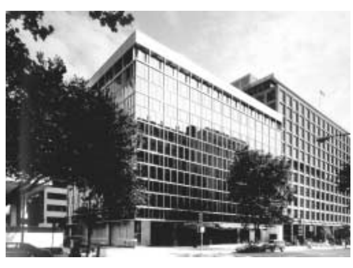
Fig. 8. International Union of Operating Engineers headquarters, after renovation was completed by Einhorn Yaffee Prescott, 1998.

rehabilitating works of mid-century Modernism that address building elements that either affect energy consumption (curtain-wall assemblies, light fixtures, diffusers, etc.) or provide a specific life-safety or accessibility function (elevators, escalators, stair and guard-rail assemblies, exit signs, etc.) where, as is noted above, substantial change to the component may be dictated by code or performance standards. In weighing the decision as to whether saving an element is the best solution — from the standpoint of both design/preservation and sustainability — the ecological cost of refurbishing the existing component must also be evaluated relative to the energy consumed and lost if the component is to be replaced, if it becomes necessary to move the element any distance off site for refurbishment, and if the process of renewal must use either excessive energy or chemicals that may damage the environment.