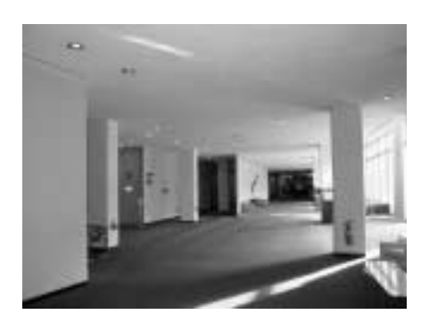
Fig. 5. The United Nations Headquarters Board of Design (Wallace K. Harrison, Director of Planning), the United Nations Headquarters, New York, 1952. The corridor outside the Council Chambers typifies the lack of ornamentation throughout the building's interior. Photograph 2003.