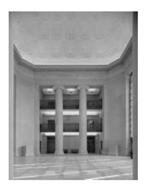
Fig. 2. William Welles Bosworth, Building 7, MIT Main Group, Cambridge, Massachusetts, 1938; restoration by Einhorn Yaffee Prescott, 2002. Photograph courtesy of A. J. Martini Construction, 2002.

Villa Savoye and Mies van der Rohe's Barcelona Pavilion were largely handmade — by the end of World War II, the construction industry realized that it no longer had to mask the potential of the machine-made product but could instead feature it as a critical component of the new aesthetic (Fig. 1). The building industry had been using mass-produced components for many years before the onset of the hegemony of Modernism, but these elements usually had their industrial nature obscured by both designer and fabricator alike and were made to appear as though they were in fact traditional architectural elements. A late example is William Welles Bosworth's monumental 1938 Beaux-Arts lobby for Building 7 at Massachusetts Institute of Technology (MIT), the last component to be constructed of the original MIT Main Group. The cast-stone interior is virtually indistinguishable from natural limestone (to the point where two professors of architecture who had been at the school for more than 30 years were not aware that the material was cast stone), and the balcony railings are filigreed metal panels in cast aluminum that are detailed and painted to imitate bronze (Fig. 2).