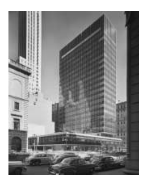
Fig. 6. Skidmore Owings and Merrill, Lever House, New York, 1952.

feature, a strong argument can certainly be advanced that this replacement was the correct course of action to preserve both the spirit of newness and industry embodied in this system and the appearance of the building.