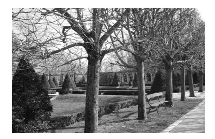
Fig. 5. Significant historic designed landscapes — such as Kykuit, the Rockefeller estate in Westchester County, New York — will face management challenges if their historic plants cannot thrive in a changing climate.