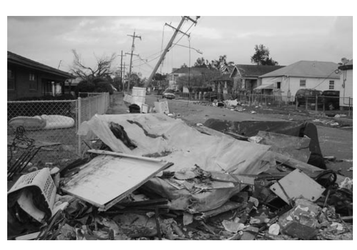
Fig. 6. Natural disasters, such as Hurricane Katrina in New Orleans in 2005, may be partially caused by changes in weather patterns due to global

British gardens, although there is scant direct reference to historic landscapes.35