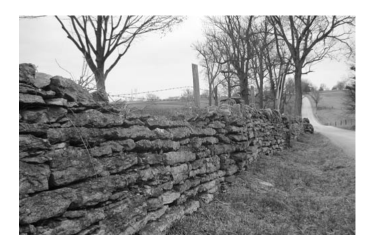
Fig. 7. Character-defining cultural-landscape features, such as this bluegrass region near Lexington, Kentucky, are susceptible to gradual deterioration due to warmer temperature, increased or decreased precipitation, and changes in surrounding plant communities.