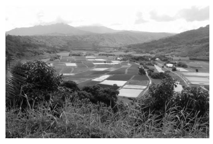
Fig. 8. Significant rural landscapes, such as Hanalei, Hawaii, have developed over decades or centuries in response to local soils and climate. They may be seriously threatened by substantial changes to the environment that has enabled them to grow and thrive.

environments, including historic landscapes. The primary threats noted are: