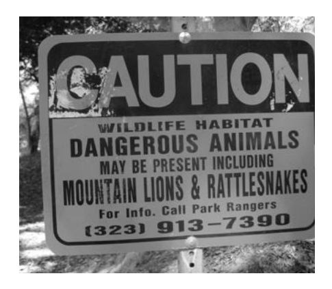
Fig. 4. With changes in climate patterns at many levels, invasive wildlife may seek friendlier habitats, such as this example from Griffith Park in Los Angeles.

In a 1981 article British journalist and writer Marion Shoard tackled many