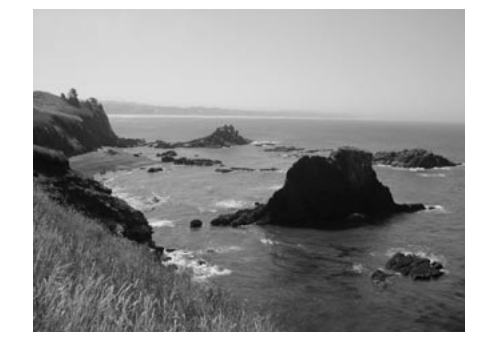
Fig. 1. Sea levels globally are estimated to have risen more than half a foot in the twentieth century, with considerable impact on historic resources, as seen here on the Pacific Coast near Newport, Oregon.

These are not projections; they are conclusions drawn from years, and in some cases decades, of data collection.