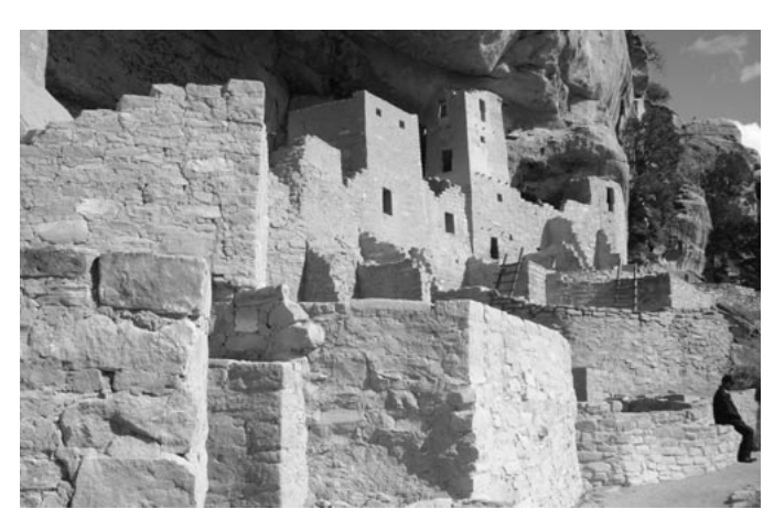
Fig. 3. Cultural resources at national parks, such as these cliff dwellings at Mesa Verde, may deteriorate due to either an increase or decrease in precipitation.

The same report also outlines the reasons for the changes.5